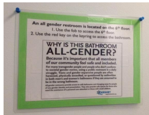
NCJW Washington Office Sign